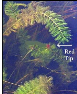
Eurasian Water Milfoil